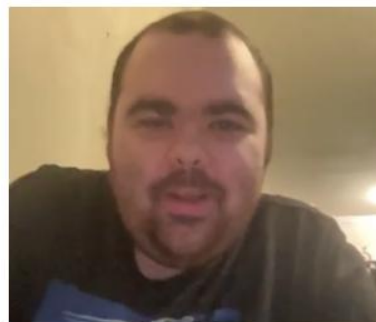
Tony produced the credit roll for the video!